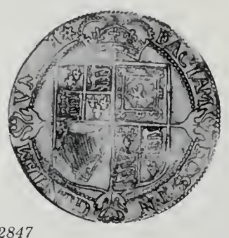
Lot No. 2847